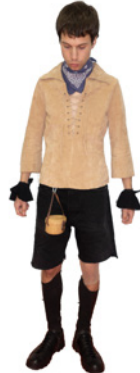
THE SCOUT / SQUIRE READY FOR HYDROTHERAPY