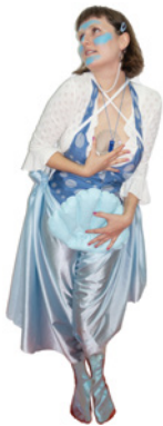
THE WATERBIRTH INSTRUCTOR