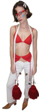
THE SPEED RIDER/DEEP DIVER DRIPPING FEELINGS