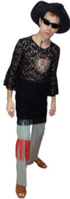
THE LACELORD WITH A THING FOR FRINGES