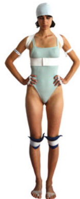
THE AEROBICS TRAINEE BLUE CRYSTAL REGULAR