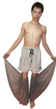
THE BUTTERFLY SWIMMER WITH SENSITIVE CALVES & EYES