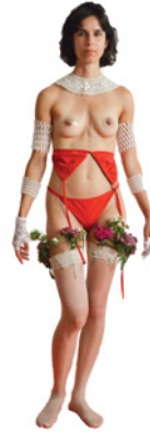
MISS SANATORIUM AKA "FLOWER THIGHS"